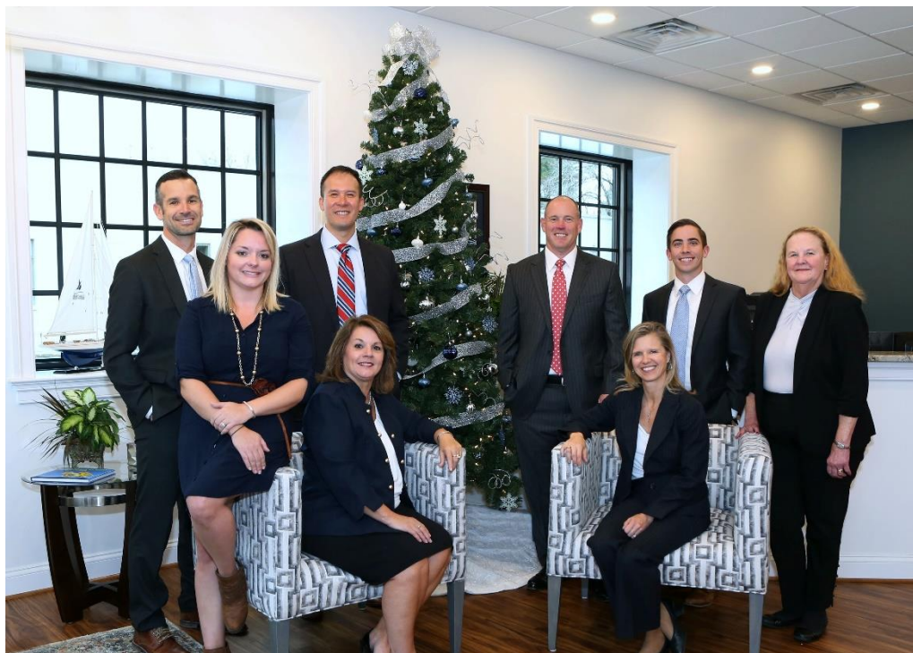
MAINSAIL WEALTH ADVISORS